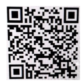
New Facebook page